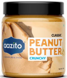
{ Classic Peanut Butter } Crunchy