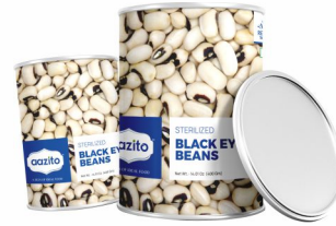
{ Sterilized } Black Eye Beans