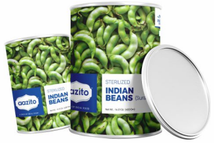
{ Sterilized } Indian Beans ( Surat papdi )