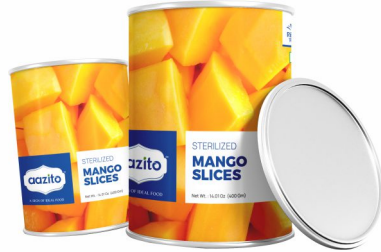
{ Sterilized } Mango Slices