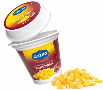
{ Sterilized Sweet corn Kernels } Schezwan