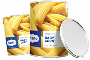
{ Sterilized } Baby Corn