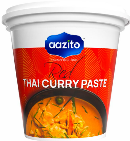
RED Thai Curry Paste