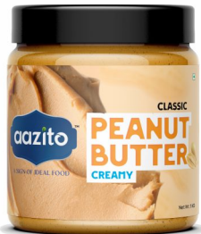
{ Classic Peanut Butter } Creamy