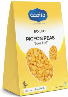
{ Boiled } Pigeon Peas ( Toor Dal )