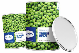
{ Sterilized } Green Pigeon Peas ( Tuver Daal )