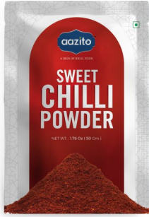
Sweet Chilli Powder