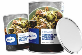
{ Sterilized } Tropical Mix Veg Curry (Undhiu)