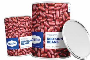
{ Sterilized } Red Kidney Beans