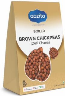
{ Boiled } Brown Chickpeas ( Desi Chana )