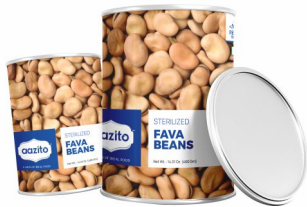
{ Sterilized } Fava Beans