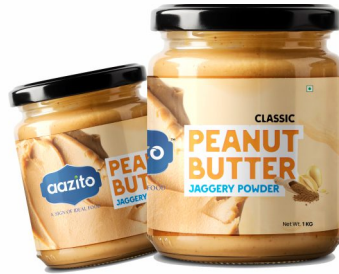
{ Classic Peanut Butter } Jaggery Powder