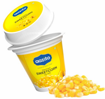
{ Sterilized } Sweetcorn Kernels