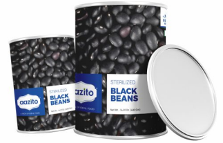
{ Sterilized } Black Beans