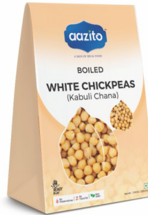
{ Boiled } White Chickpeas ( Kabuli Chana )