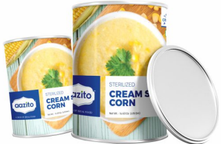
{ Sterilized } Cream Style Corn