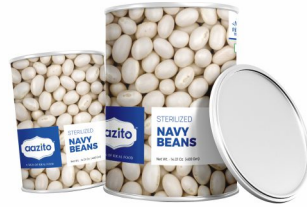
{ Sterilized } Navy Beans