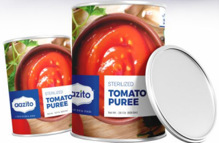
{ Sterilized } Tomato Puree

We introduce a delicious variety of Ready to Eat and Ready to Cook foodstuff. We have Indian cuisine food from different state's famous dishes which are rich in taste and aromas. Aazito's Ready to Eat Products are made with real and fresh vegetables audited from selected farmers. Our product is made with Sterilization Technology so no need for preservatives. We provide 100% natural food without MSG and Artificial Colors. So don't worry about the quality, Just buy it and eat it at any time anywhere.