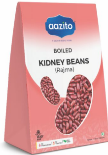
{ Boiled } Kidney Beans ( Rajma )