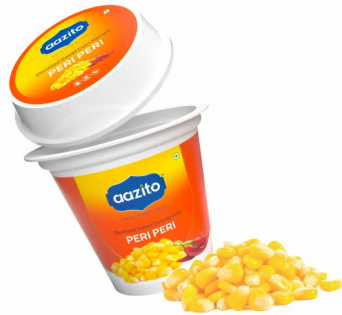
{ Sterilized Sweet corn Kernels } Peri Peri