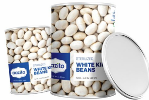
{ Sterilized } White Kidney Beans