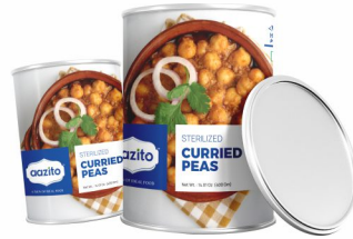
{ Sterilized } Curried Peas