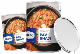
{ Sterilized } Pav Bhaji