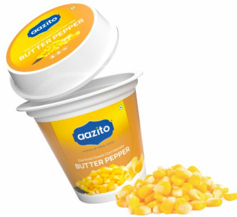
{ Sterilized Sweet corn Kernels } Butter Paper