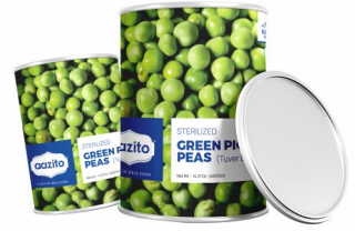
{ Sterilized } Green Peas