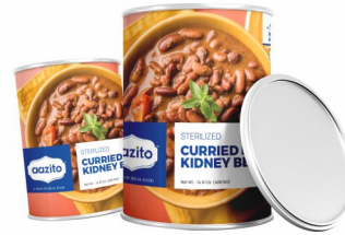
{ Sterilized } Curried Red Kidney Beans