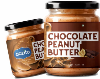
{ Peanut Butter } Chocolate