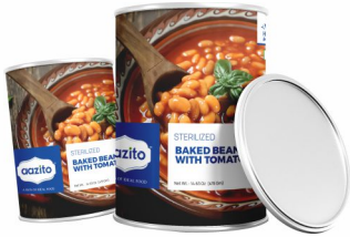
{ Sterilized } Baked Beans With Tomato