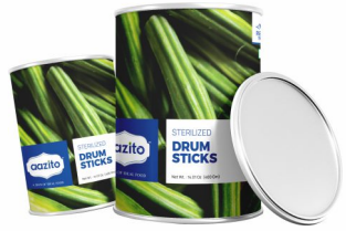
{ Sterilized } Drum Sticks