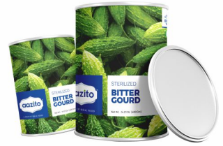
{ Sterilized } Bitter Gourd