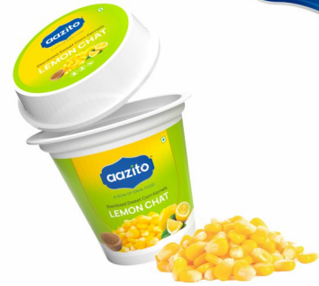
{ Sterilized Sweet corn Kernels } Lemon Chat