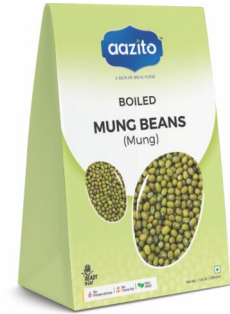
{ Boiled } Mung Beans ( Mung )