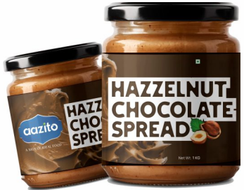
Chocolate Spread Hazelnut

Aazito's Chocolate Spread is made from Imported Cocoa powder and Hazelnut known as filberts. Hazelnut has a huge amount of nutrients, vitamins, minerals, and fibers. Aazito Chocolate spread is made with all-natural ingredients and without synthetic colors and flavors. Aazito's Chocolate Spread is eaten mostly use to spread on bread or toast, you can also use it with muffins, shakes, pancakes, and pitas.