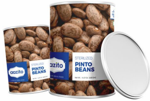
{ Sterilized } Pinto Beans