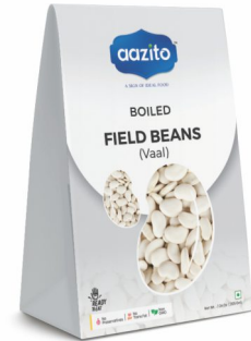
{ Boiled } Field Beans ( Vaal )