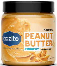
{ Natural Peanut Butter } Crunchy