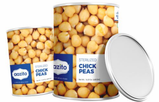
{ Sterilized } Chick Peas