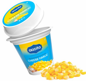
{ Sterilized Sweet corn Kernels } Cheese Garlic