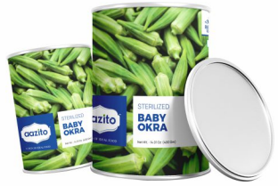
{ Sterilized } Baby Okra