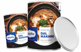
{ Sterilized } Dal Makhni