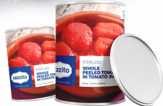
{ Sterilized } Peeled Tomato in Tomato Juice