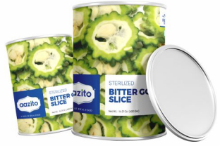
{ Sterilized } Bitter Gourd Slice