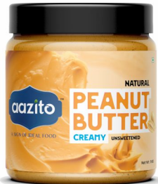
{ Natural Peanut Butter } Creamy