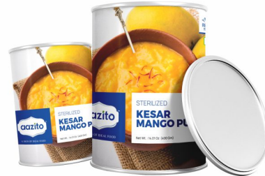
{ Sterilized } Keshar Mango Pulp