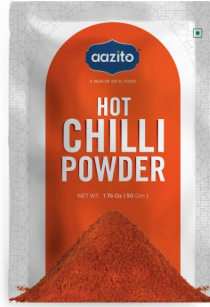
Hot Chilli Powder