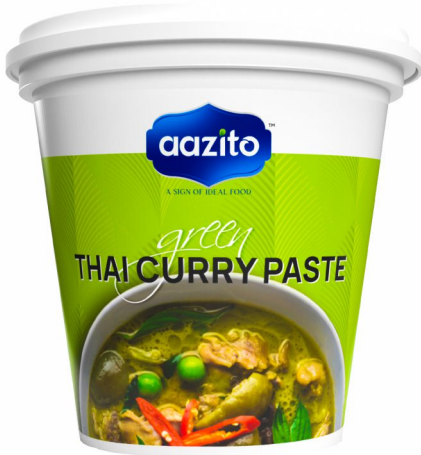
GREEN Thai Curry Paste