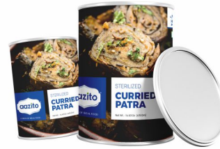
{ Sterilized } Curried Patra