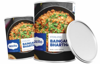
{ Sterilized } Baingan Bhartha