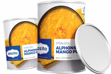
{ Sterilized } Alphonse Mango Pulp