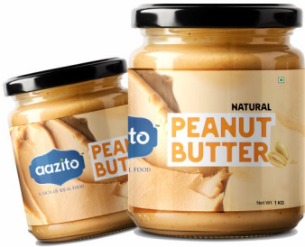
{ Peanut Butter } Natural