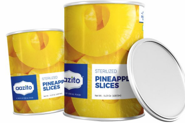
{ Sterilized } Pineapple Slices